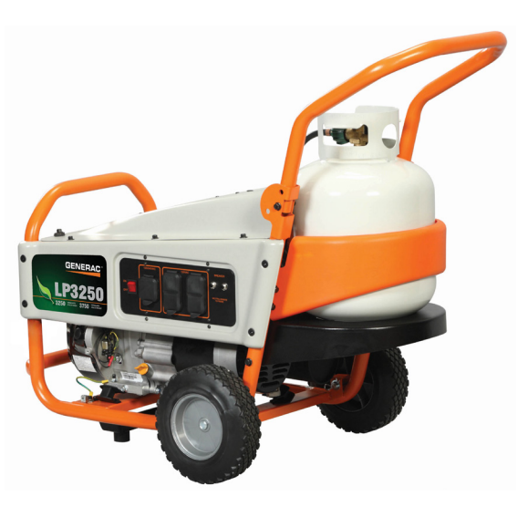
Not for Sale in the City of LA

AC Rated Output Running Watts 3250 AC Maximum Output Starting Watts 3750